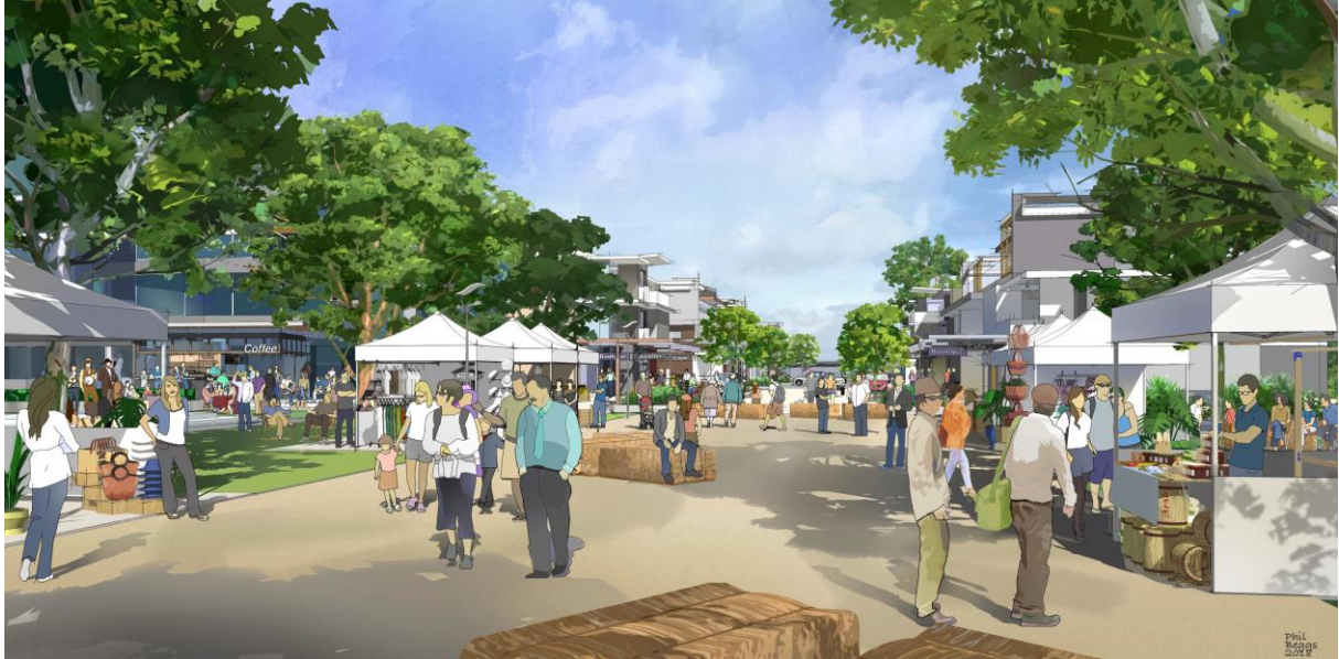
Figure 2 Artist impression of the Civic Space proposed by the draft Master Plan presented at the community workshops