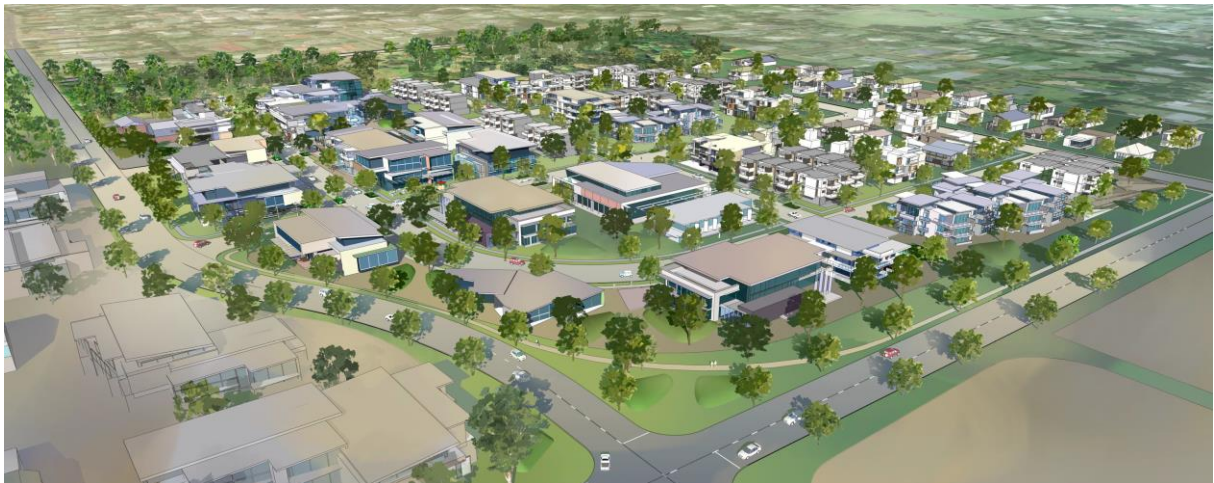
Figure 3 Artist impression of part of the draft Master Plan area presented at the community workshops