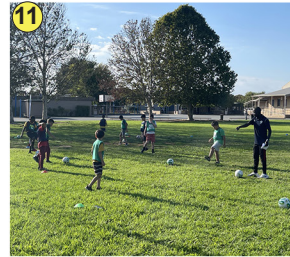
Kick about area