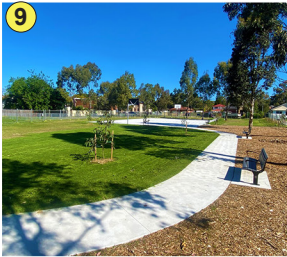
Park seat on path as rest stop