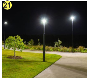
Lighting along path