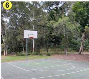
Relocated basketball half court away from club house and orient in north-south direction