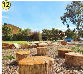
'Boulder walk' including steppers and logs