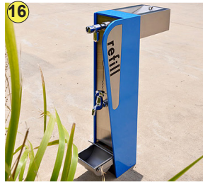
Accessible drink fountain