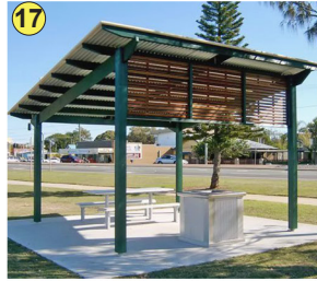
Shelter with picnic setting and BBQ