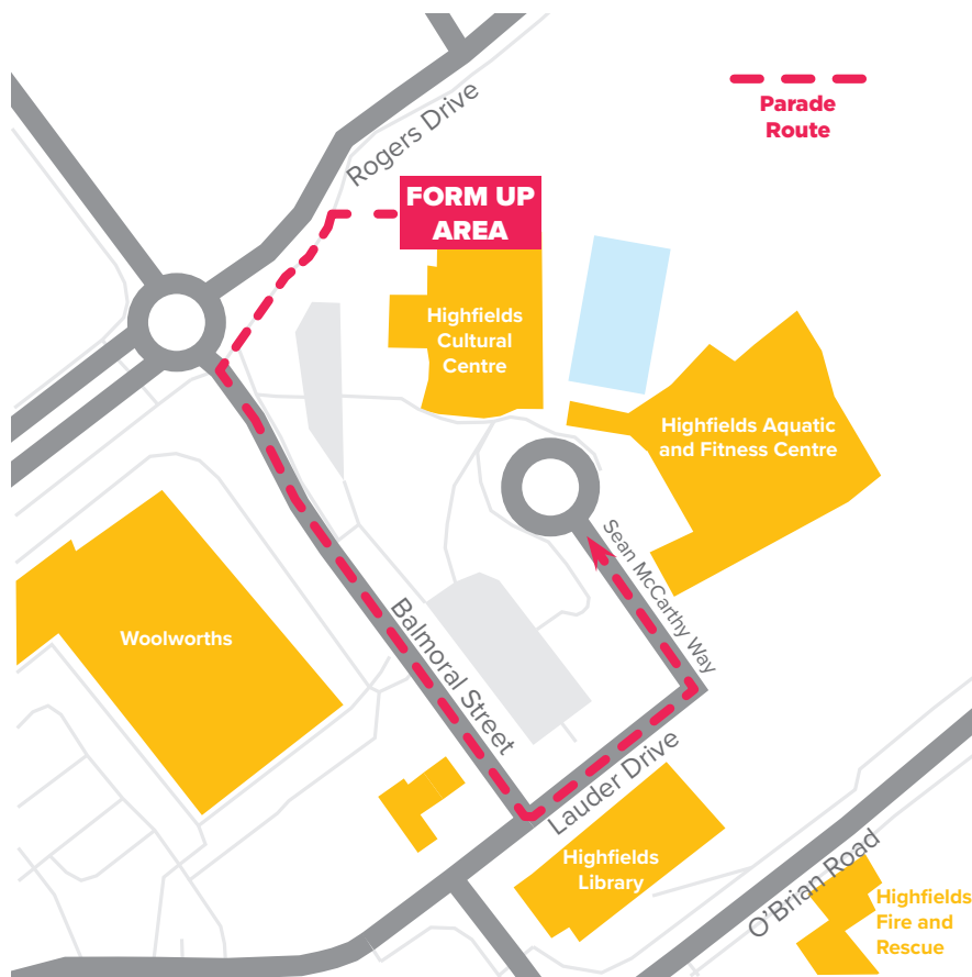
Map – designating form up and parade route.

Those requiring disability parking within the Cultural Centre car parking area are to arrive prior to 9.30am